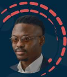
Michael Thompson Small Foundation